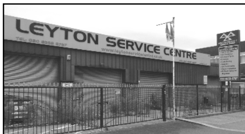
Leyton Service Centre - yet more flats

The Leyton Service Centre at 404 – 424 Leyton High Road has been given planning permission to convert the business into a retail outlet on the ground floor and 9 flats above. It seems the Council can't wait to give developers permission to build more expensive flats that local people cannot afford.