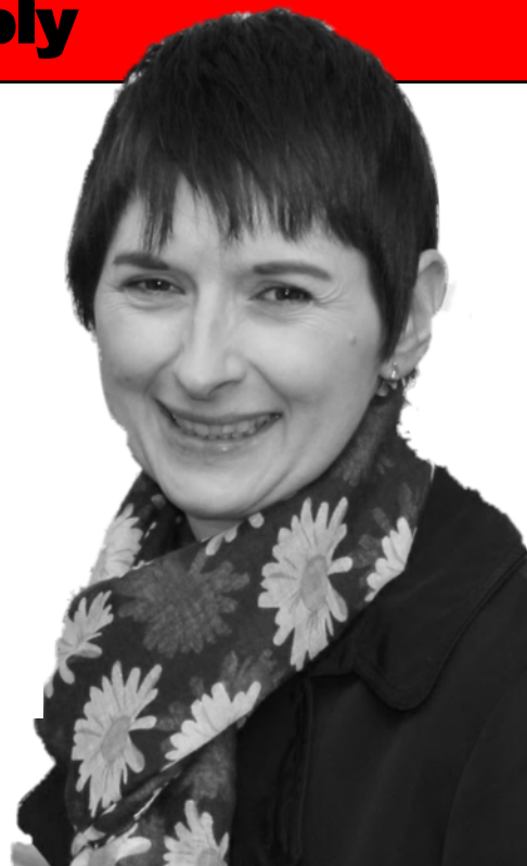
Caroline Pidgeon - Lib Dem candidate for Mayor of London

London deserves a candidate who actually cares about the issues and isn't just in it to further their Westminster careers.