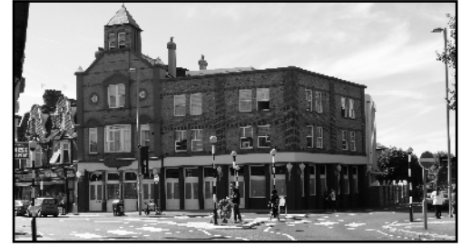
The former Lion and Key pub at the junction of Church Road and Leyton High Road

A few years ago the owners of the Lion and Key pub got permission to turn it into a mental health drop in centre. The Council was pleased as the façade of the pub was kept and a useful health facility was built. Local residents were pleased as they were not now woken up with disturbances from the pub.